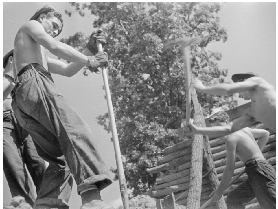
Civilian Conservation Corps (CCC) workers, Prince George's County, Maryland, 1935. The CCC brought together Americans who might not otherwise have crossed paths to work on conservation projects around the country.

When FDR took office in the Depression's darkest days, the economist John Maynard Keynes wrote him a somber letter expressing hope for the New Deal's program of "reasoned experiment" within "the existing social system." "If you fail, rational change will be gravely prejudiced throughout the world, leaving orthodoxy and revolution to fight it out," he wrote. "But, if you succeed, new and bolder methods will be tried elsewhere, and we may date the first chapter of a new economic era from your accession to the office."