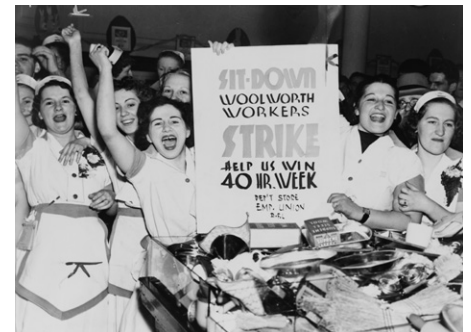
Woolworth’s workers strike for a forty-hour week, 1937. Despite setbacks for the New Deal in 1937, in 1938 Franklin D. Roosevelt’s administration achieved the long-sought goal of passing the Fair Labor Standards Act, which set a federal minimum wage and maximum workweek and imposed the first federal ban on child labor.

The New Deal left the country far better equipped to face the next calamity—World War II—and set the stage for the G.I. Bill, a tide of postwar prosperity, and the broadest middle class the world had ever seen.