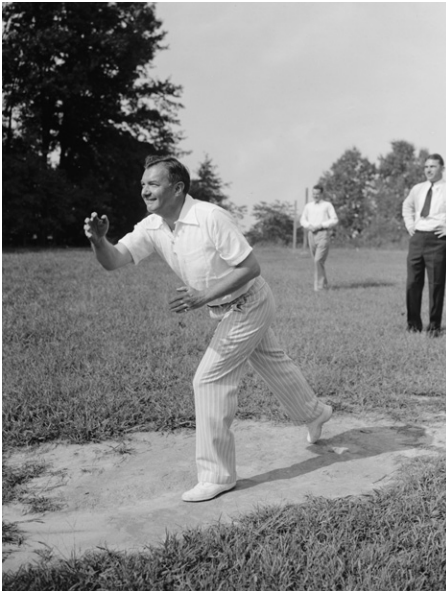
U.S. Solicitor General Robert H. Jackson throws out a pitch for his team, the New Dealers, at a Justice Department picnic outside Washington, DC, 1938. Jackson, a scrupulous observer of judicial ethics and a supporter of human rights who never attended college, went on to be Franklin D. Roosevelt's attorney general, an FDR-appointed Supreme Court justice, and finally chief U.S. prosecutor at the Nuremberg war crimes trials. He was but one of the many idealistic New Dealers whom FDR brought to Washington, a group far more representative of America's diversity than previous administrations.