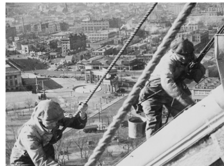
Workers hired by the temporary Civil Works Administration (CWA) paint the gold dome of the Colorado State Capitol in Denver, 1934. The CWA’s success at putting Americans to work inspired the New Deal’s largest single endeavor, the Works Progress Administration, which employed millions of Americans in jobs that ranged from building roads to teaching impoverished adults to read and write.

The year 1937 brought a loss of momentum. FDR, thinking the worst was past, had cut back on government spending. The so-called Roosevelt recession followed. Meanwhile, FDR’s unpopular postelection proposal to appoint additional Supreme Court justices—a